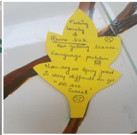
DASH PG WORKSHOP 2018