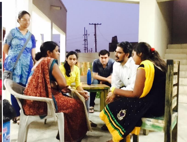
World Health Day 2017 Depression – Let's Talk