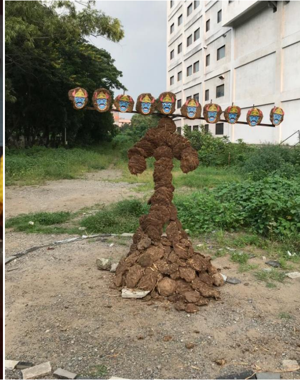
Biodegradable Ravan Burning- 9 October 2019