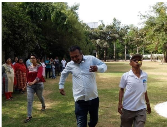
World Mental Health Day 2018