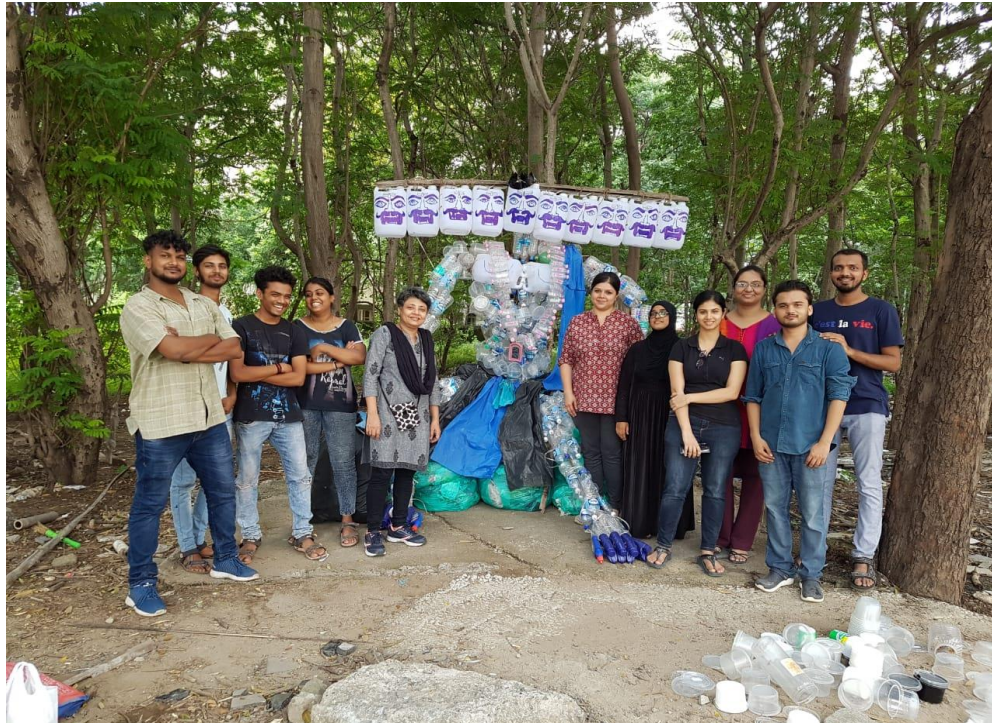
Swaccha Bharat Campaign- Making of Ravan From Plastic Waste