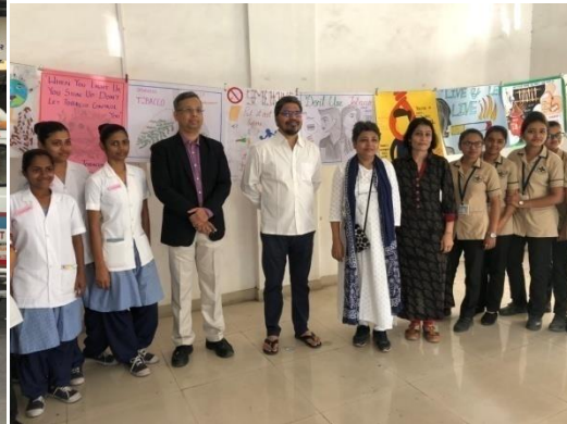
Poster making No Tobacco Day 2019