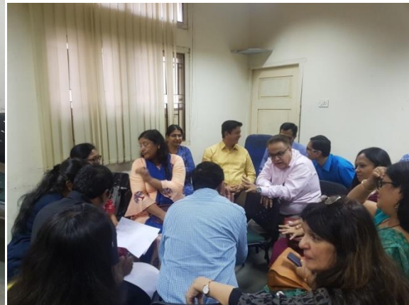
PG guides training