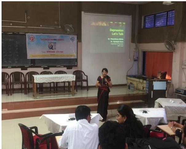
Mental health awareness week April 2017