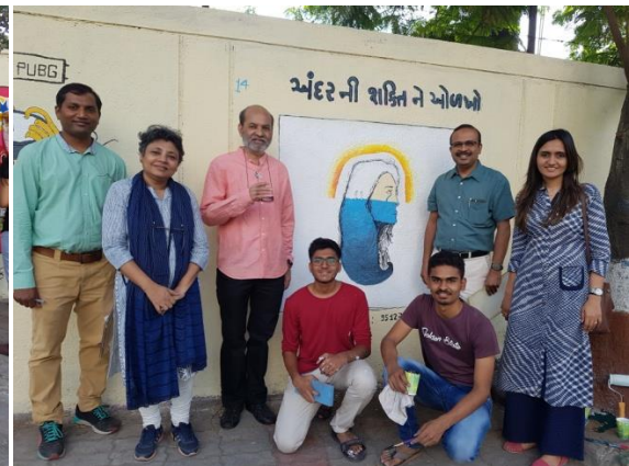
Wall Paintings on Mental Health Awareness during EUCRASIA 2019