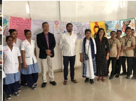
Poster making No Tobacco Day 2019