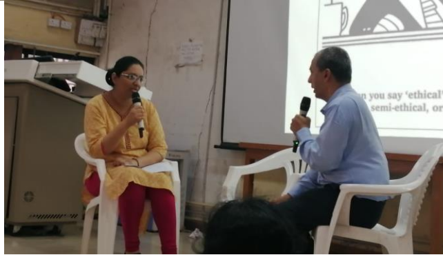
UG Orientation Program- Ethical values in Medical Profession- 14th August 2019