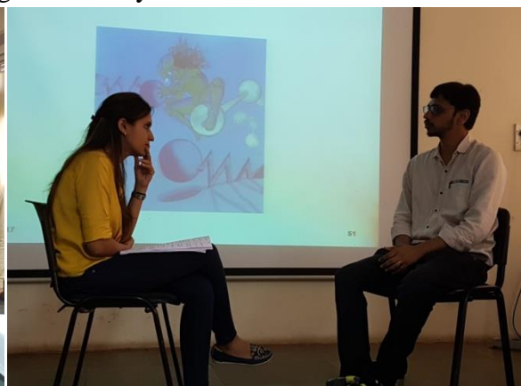
GUTS - 'Give Up Tobacco Sensibly' May 2017