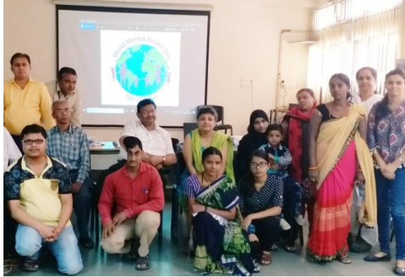
WORLD MENTAL HEALTH DAY