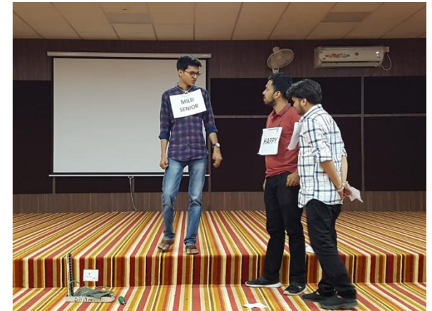
POST GRAGUDATE Orientation Programme- 25 May 2019