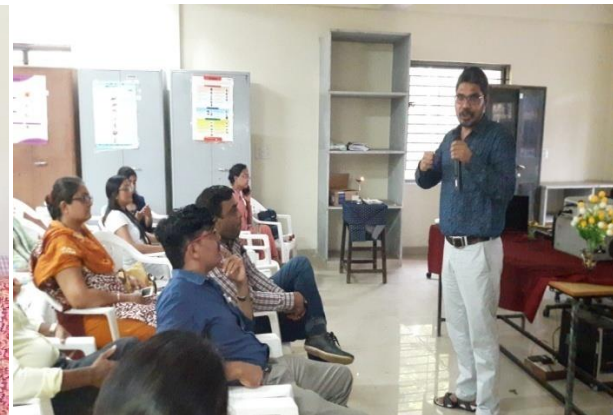
Mental Health Awareness Week Oct 2017