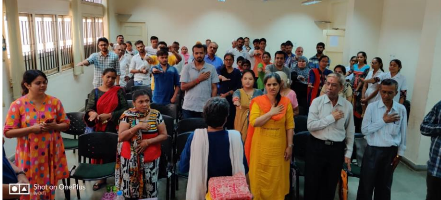
World Mental Health Day Celebrations-10 October 2019