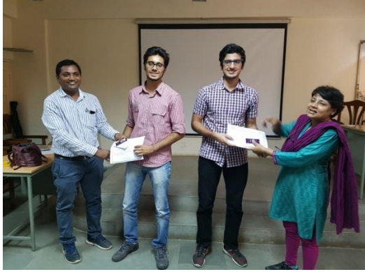
UG Quiz Zonal level September 2016