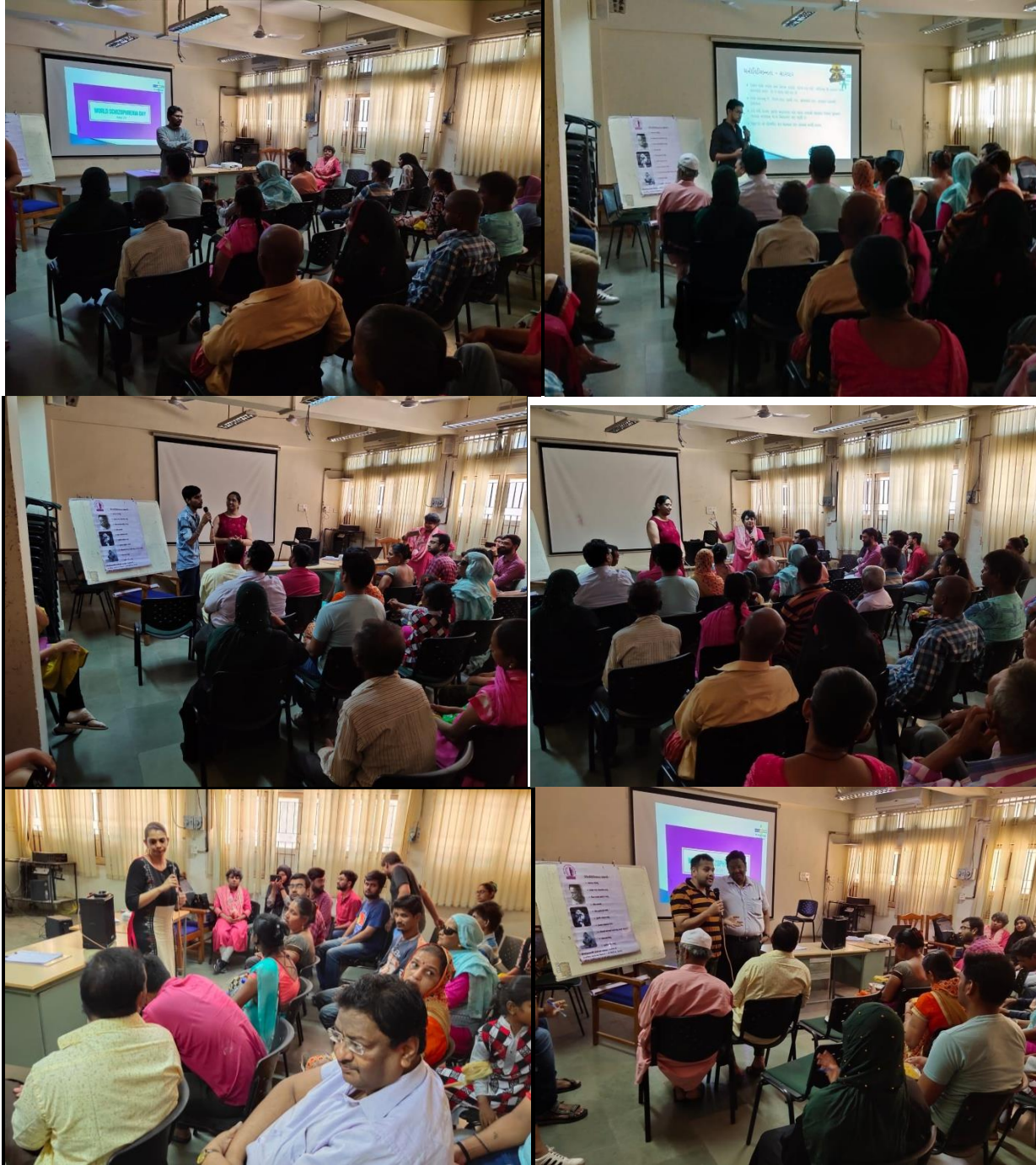
World Schizophrenia Day 24 th May 2019