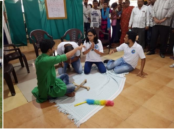
WORLD SCHIZOPHRENIA DAT 2018