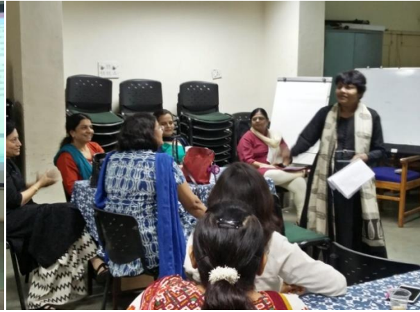
Gatekeeper training for suicide prevention July 2017