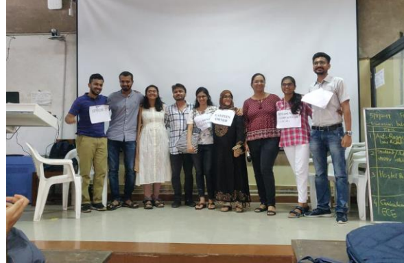
UG Orientation Program- Senior-Junior Play- 6 th August 2019