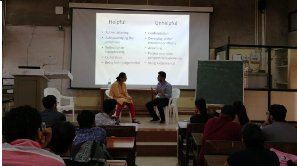
UG Orientation Program- Communication Skills- 14th August 2019