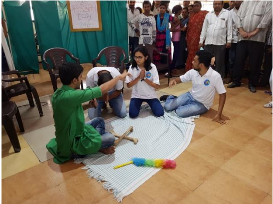
World Mental Health Day 2018