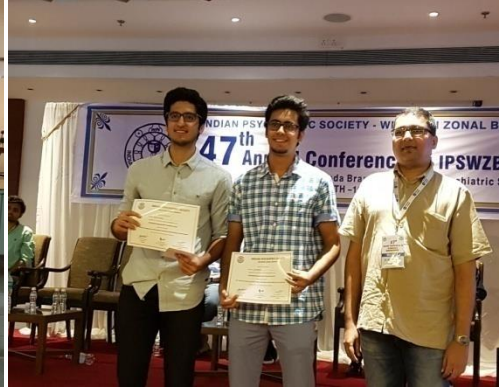
UG Quiz State level Oct 2016