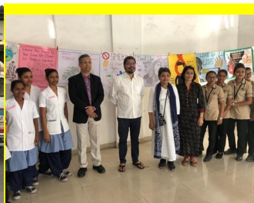
Poster making No Tobacco Day 2019