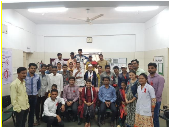
World AIDS Day 2018 at Dost Center

d) An epilepsy week to create awareness amongst the patients, Caregivers, & general population; and debunk the myths related to epilepsy by showing videos and interactive sessions by doctors was celebrated in OPD 13, NCH, Surat in January.