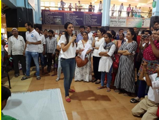
World Mental Health Day 2018