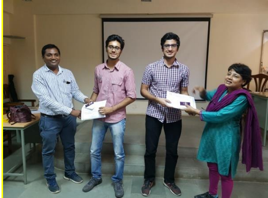
UG Quiz Zonal level September 2016