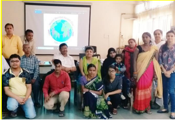
WORLD MENTAL HEALTH DAY