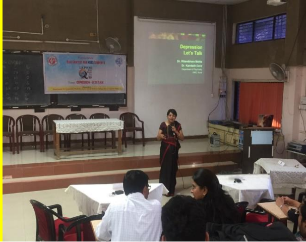
Mental health awareness week April 2017