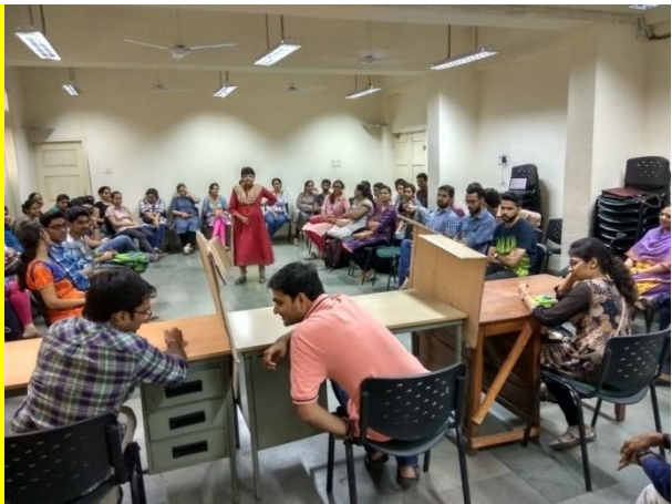
PG Induction programme May 2017