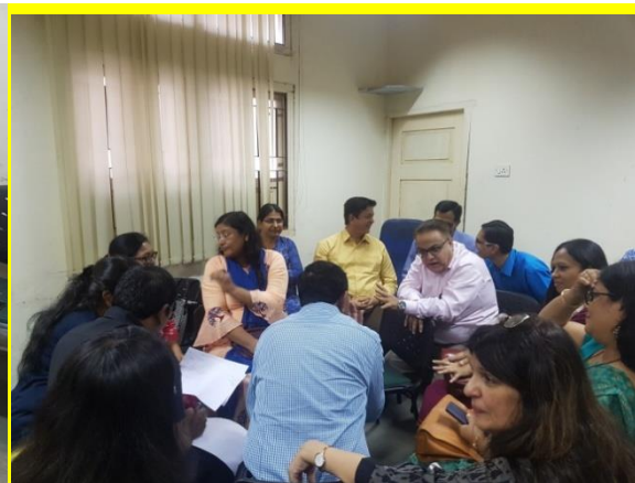
PG guides training