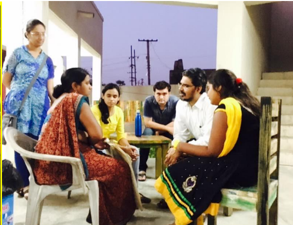
World Health Day 2017 Depression – Let's Talk