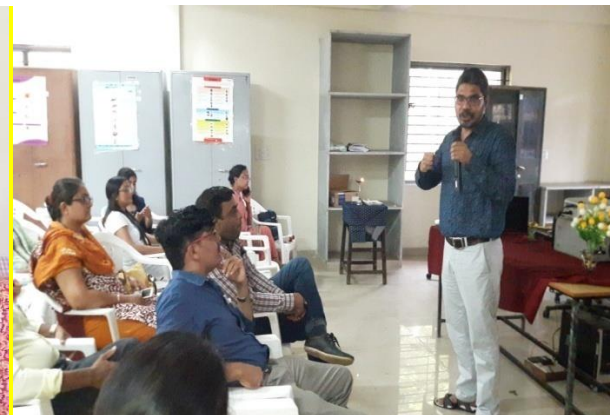
Mental Health Awareness Week Oct 2017