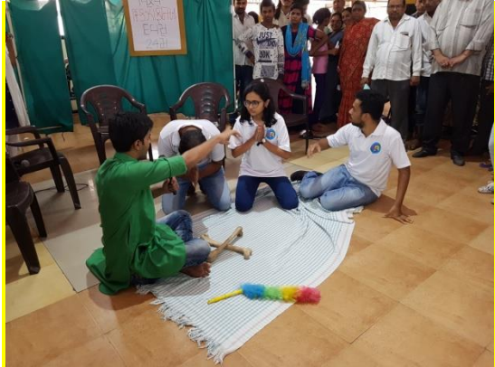
World Mental Health Day 2018