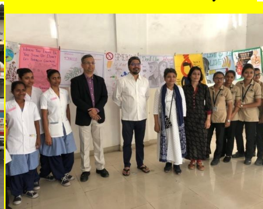
Poster making No Tobacco Day 2019