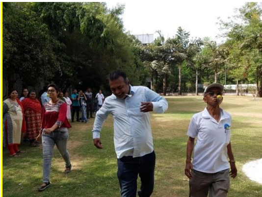
World Mental Health Day 2018