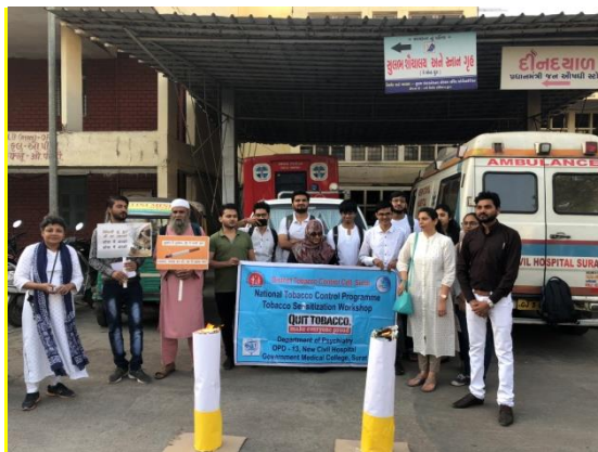
No Tobacco Day 2019