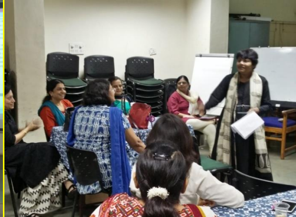
Gatekeeper training for suicide prevention July 2017