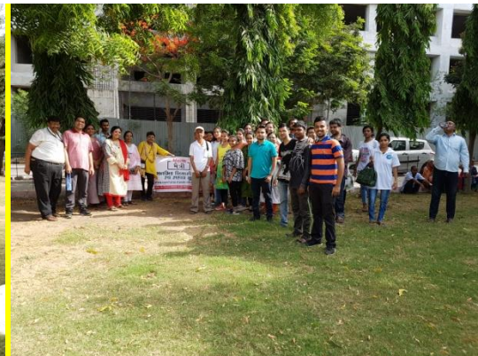
World Mental Health Day 2018