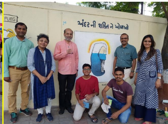
Wall Paintings on Mental Health Awareness during EUCRASIA 2019