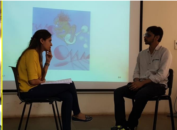
GUTS - 'Give Up Tobacco Sensibly' May 2017