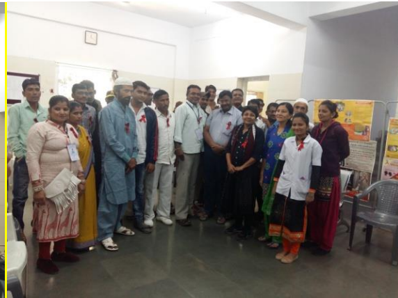
DOST center meeting 2016