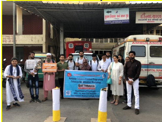
No Tobacco Day 2019