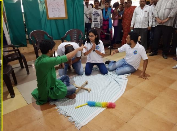
WORLD SCHIZOPHRENIA DAT 2018