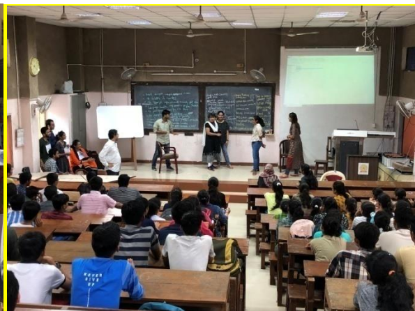
WORLD NO TOBACCO DAY 2018