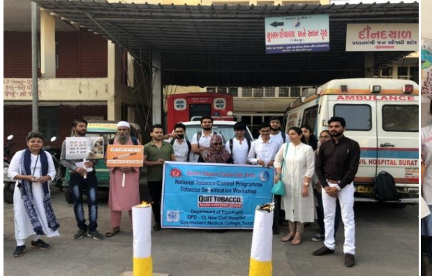
No Tobacco Day 2019