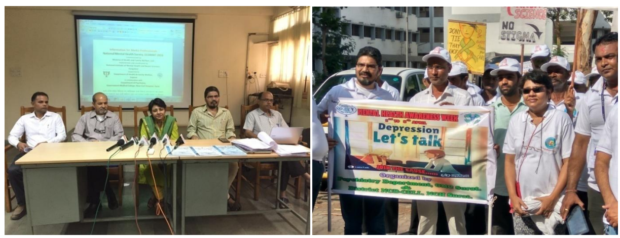
NMHS report Press Conference 2016