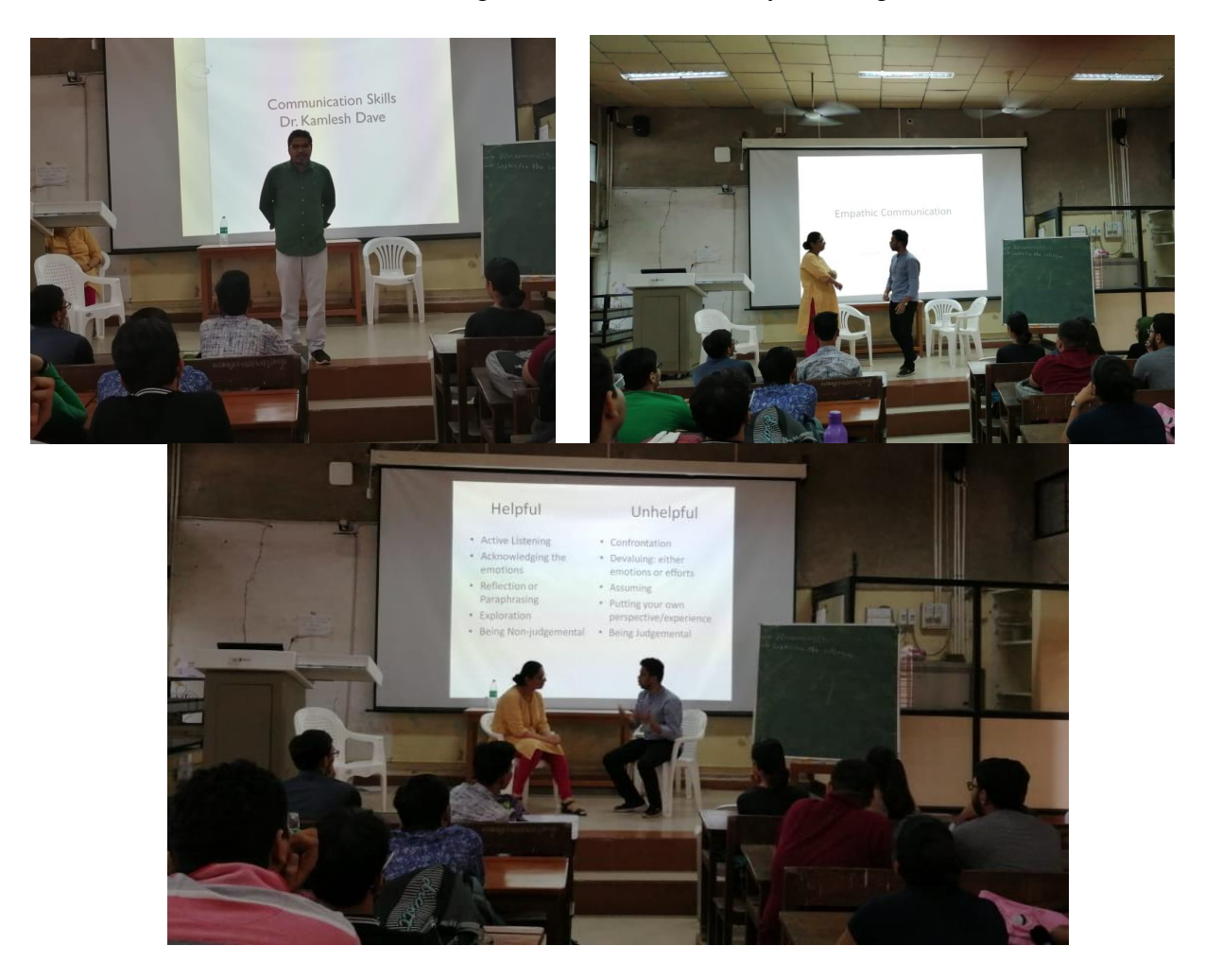
UG Orientation Program- Communication Skills- 14th August 2019