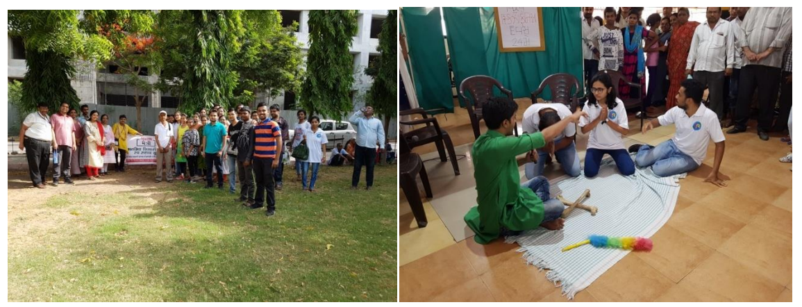
WORLD SCHIZOPHRENIA DAT 2018