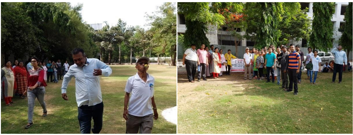
World Mental Health Day 2018