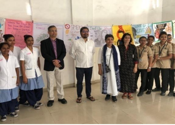
Poster making No Tobacco Day 2019