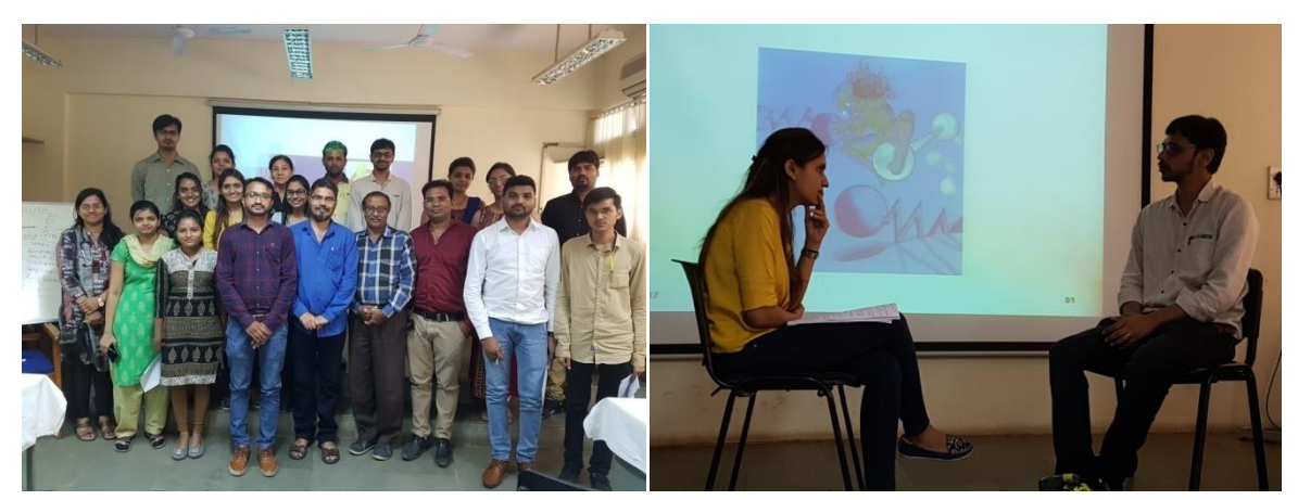
GUTS - 'Give Up Tobacco Sensibly' May 2017