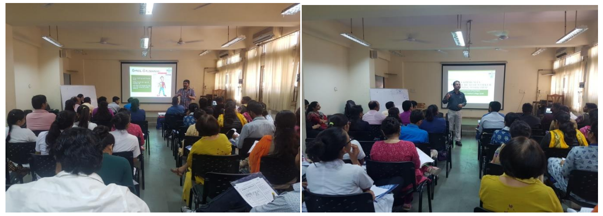
MENTAL HEALTH TRAINING FOR COMMUNITY WORKERS