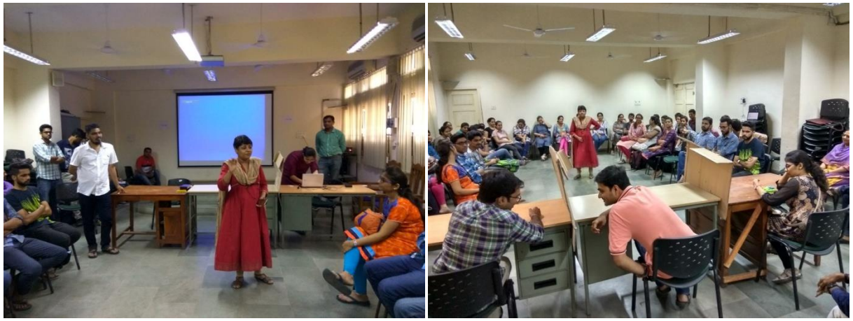
PG Induction programme May 2017