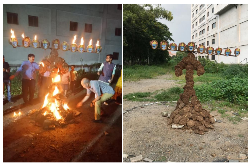
Biodegradable Ravan Burning- 9 October 2019

Swaccha Bharat Campaign- Making of Ravan From Plastic Waste