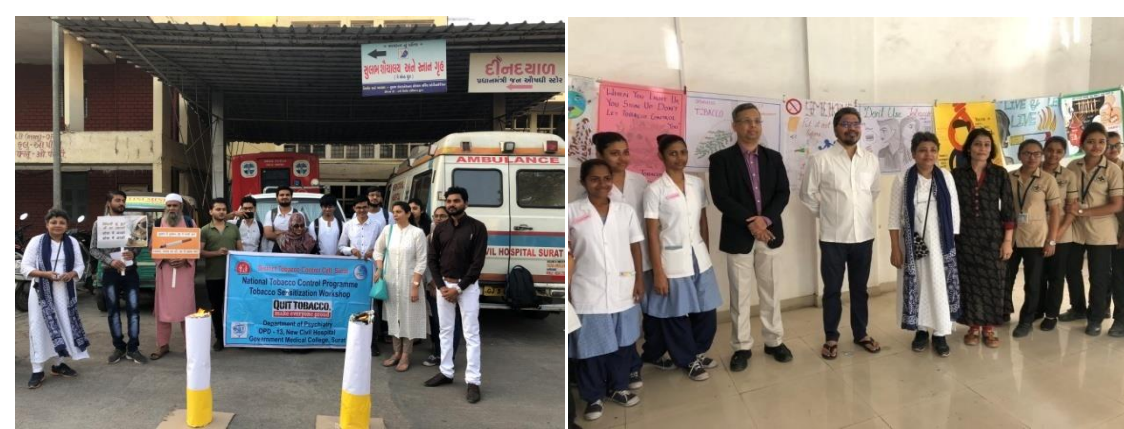
No Tobacco Day 2019