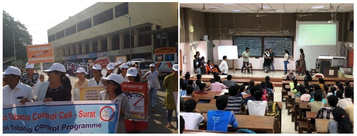
WORLD NO TOBBACCO DAY 2018