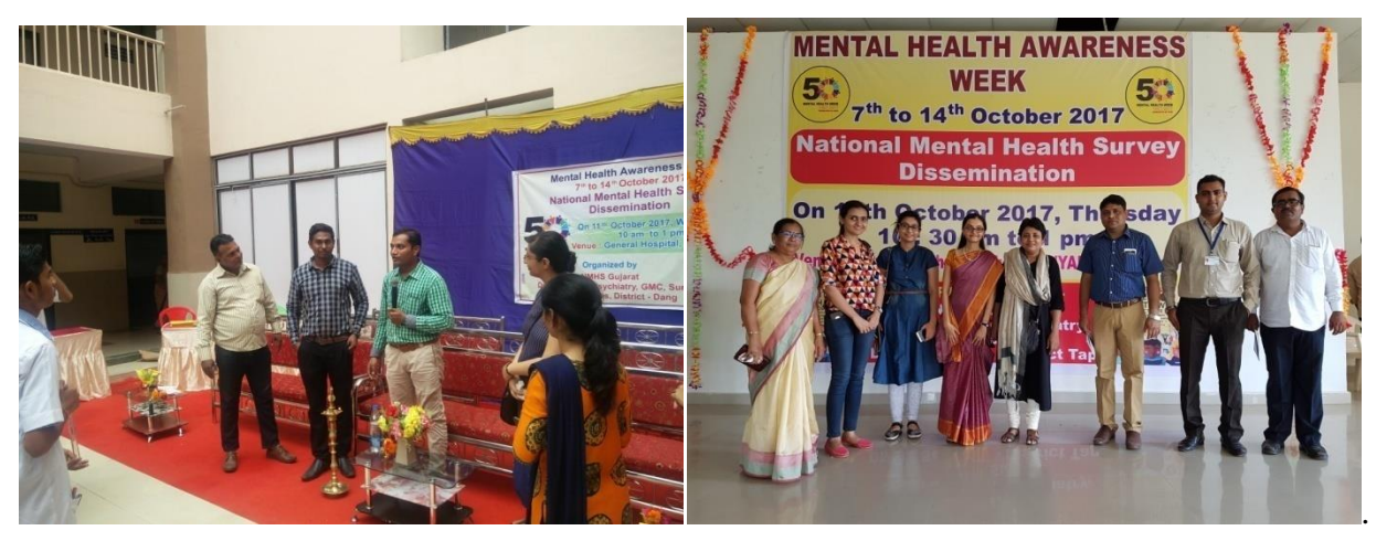
Mental Heath Awareness Week Oct 2017