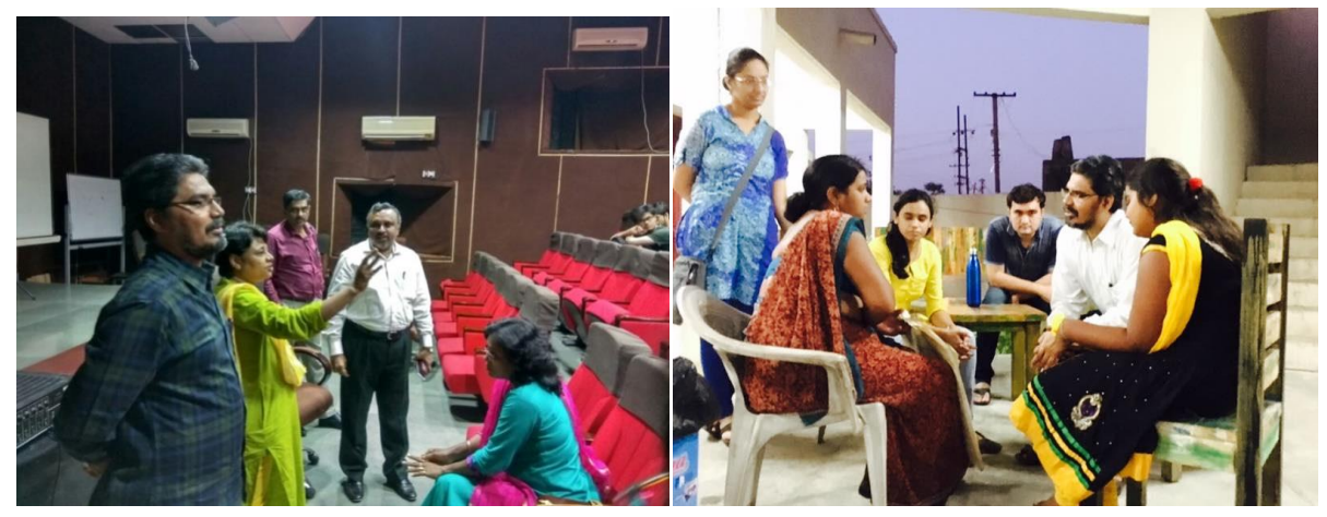
World Health Day 2017 Depression – Let's Talk