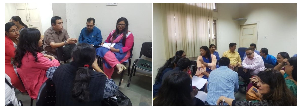
PG guides training