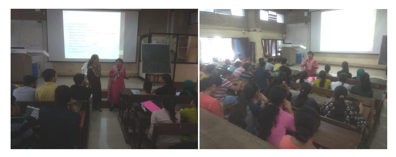
UG 1st MBBS CBME Foundation Course - Reflective Writing- 31st August 2019