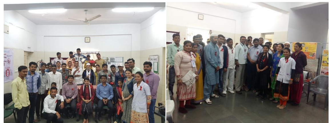
World AIDS Day 2018 at Dost Center