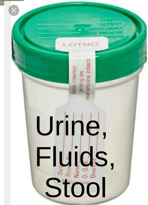
Urine, Fluids, Stool